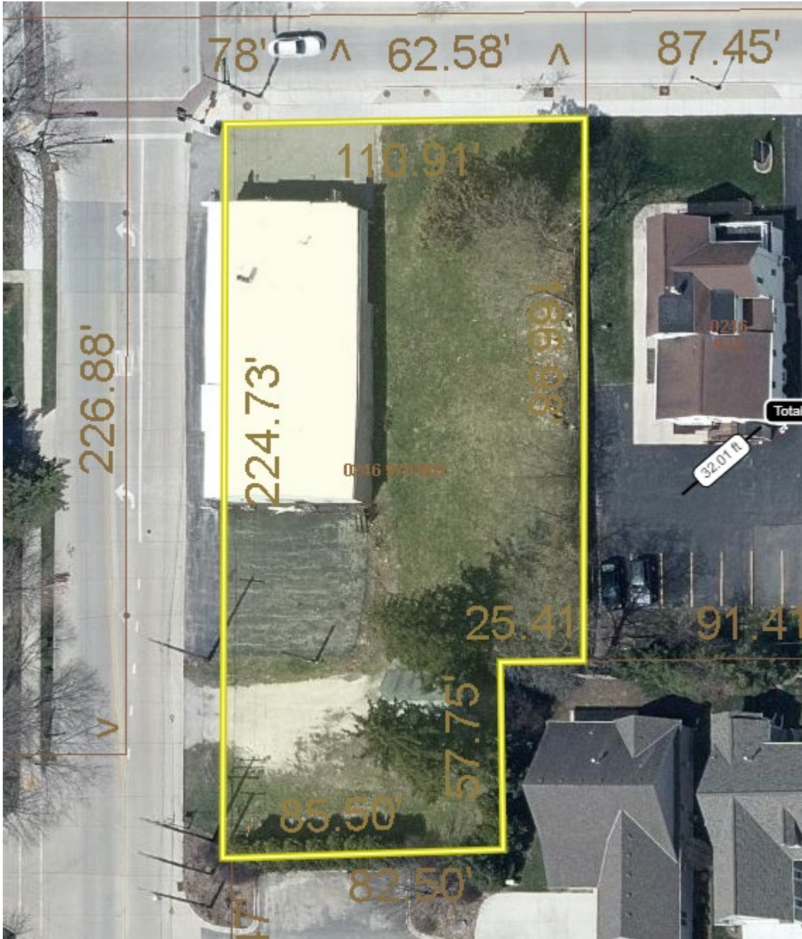
EXHIBIT B SITE MAP