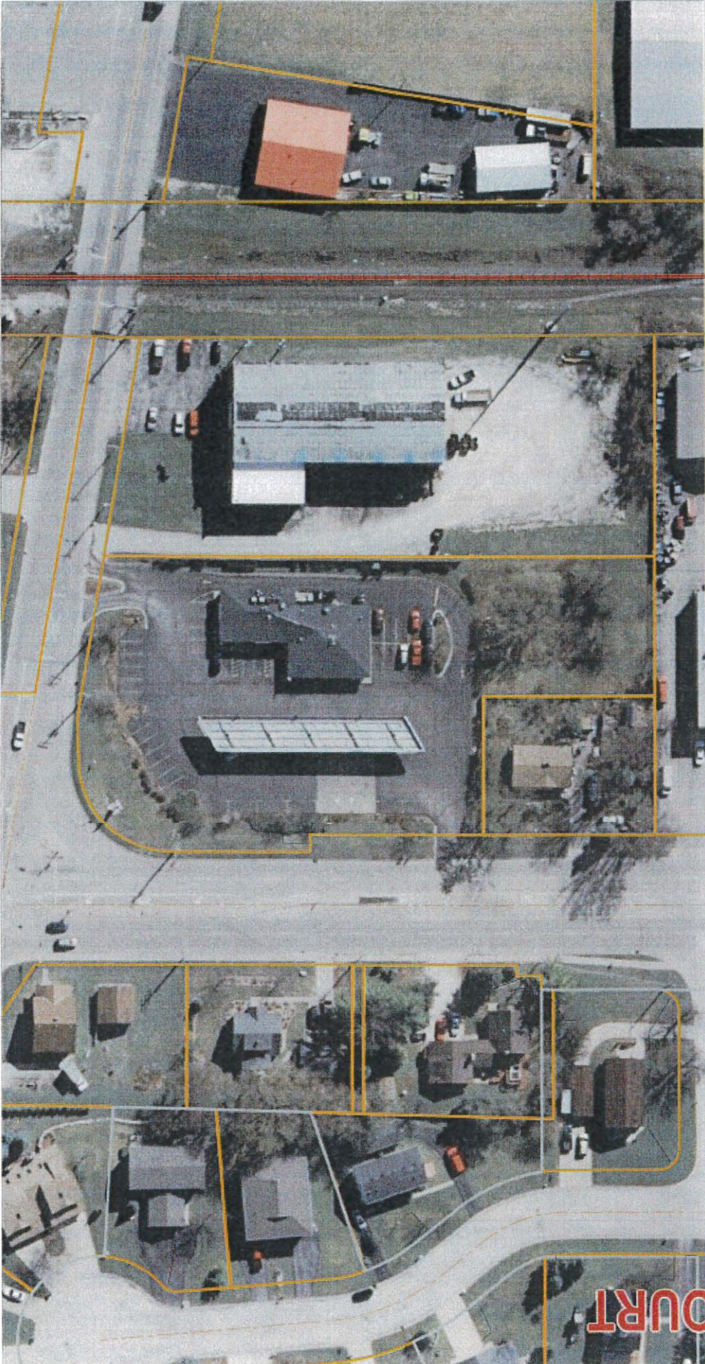
EXHIBIT B SITE MAP